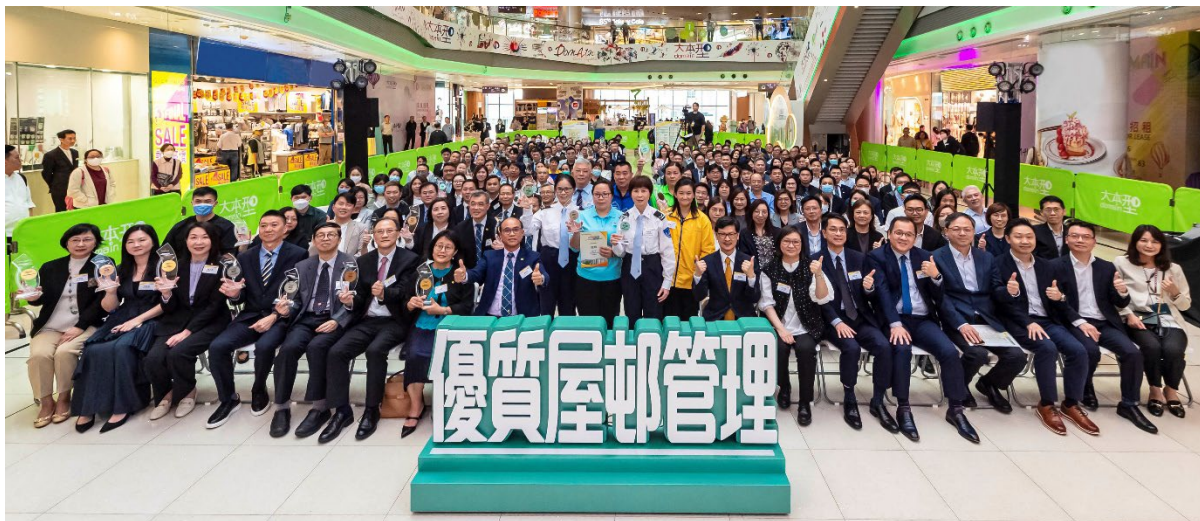
Guests pictured with award winners at the presentation ceremony.