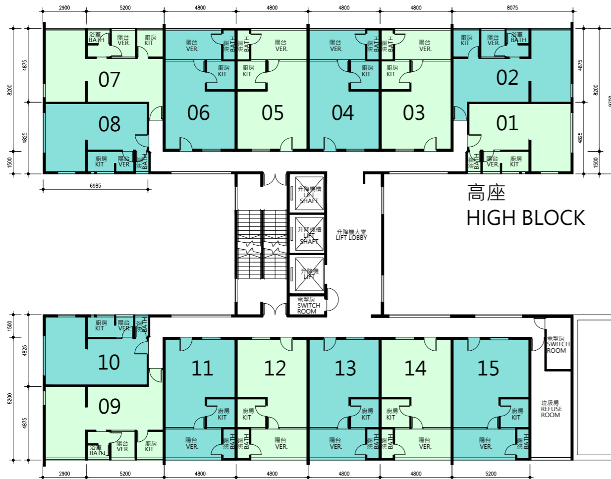
博達樓 (第5座) 高座 27樓平面圖