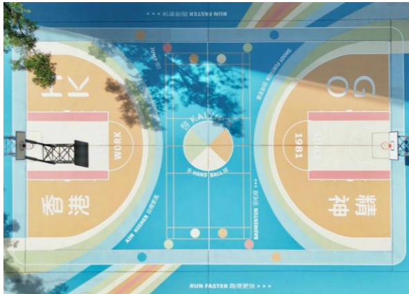
A basketball court of Kai Yip Estate has been transformed into multipurpose ball courts.