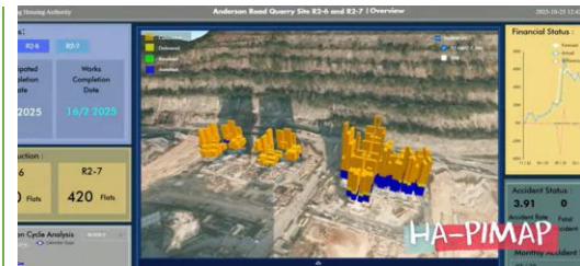
HA Project Information Management and Analytics Platform.

In collaboration with research institutes and universities, the HA continues to develop technologies and their applications in construction and estate management, and optimise housing supply in a safe and efficient manner. Advanced technologies, such as aerial drones for inspection, Internet of Things, monitoring system with artificial intelligence, have been extensively applied.