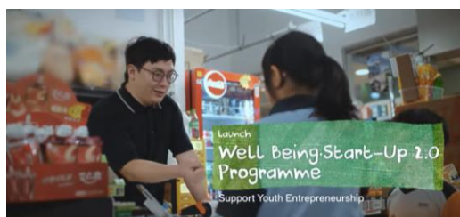
"Well Being • Start-Up" Programme enriches the shopping experience for the community with the injection of new sources of vibrancy and vitality.

Dedicated to caring for its residents' well-being, the HA has incorporated the well-being elements into public housing design and community building. The Well-Being Design Guide has been introduced to the design of estate environment, communal areas and facilities to boost residents' well-being in their daily lives. "Well Being • Start-Up" Programme supports young people to pursue their entrepreneurial dreams. Selected shop premises in HA shopping centres are made available rent-free to participants aged 35 or below for trying out their business ideas, with an aim to promote their upward mobility.