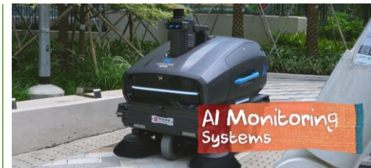
The AI monitoring system enhances efficiency of estate security.