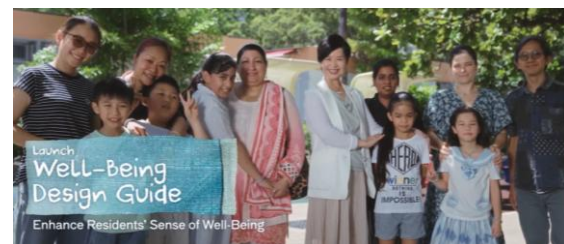
The Well-Being Design Guide serves as a reference for the design of new public housing estates and the improvement works of existing estates.

The new corporate video is now available on the Housing Authority / Housing Department Website , HA's Facebook page and YouTube channel for public viewing.