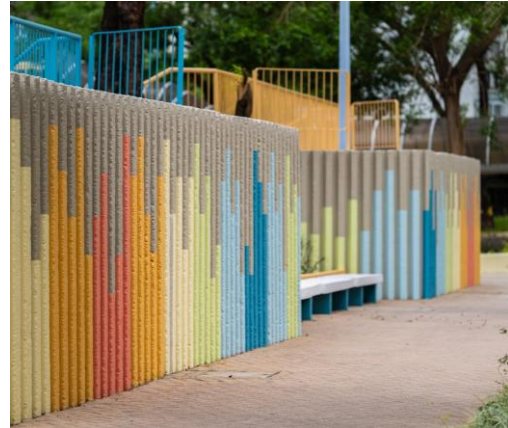
The project reshapes public spaces with a unique “Sunrise Theme” design.

Adopting a people-oriented approach, prior to the launch of the refurbishment work, the project management team has been dedicated to understanding the daily habit and actual needs of the residents of Kai Yip Estate. The project was successfully implemented with integrated resources, streamlined management processes and enhanced cross-professional collaboration. In addition, the team actively promoted community participation through interactive questionnaires, co-creation workshops, carnivals and other activities. These initiatives enabled stakeholders of the estate to become design partners, optimising harmonious community spaces and demonstrating the value of co-creation.