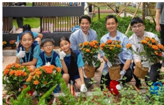
The HD team and a Tuen Mun district council member plant potted plants together with the participants.

Committed to promoting community greening and creating a more pleasant living environment for its public housing estates, the HA organised action seedling and Well-Being activities on 30 May at Hin Fat Estate, Tuen Mun. Over 50 residents, as well as representatives from schools and various organisations planted potted plants at the landscaped garden.