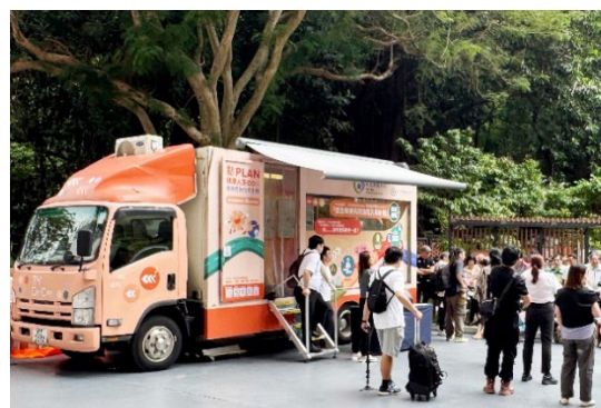
The Mobile Services Vehicle.