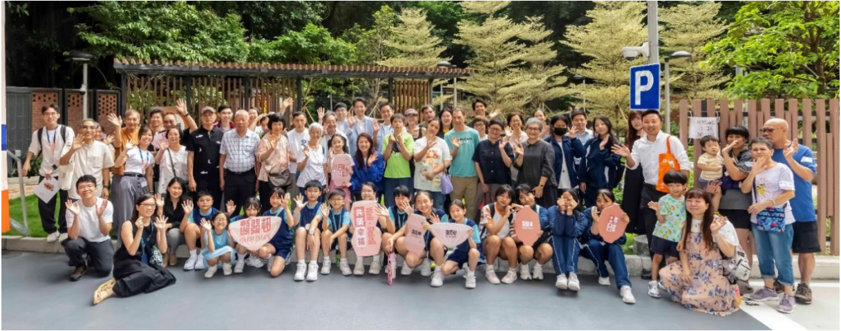
Participants pictured together at the universal service bay.

Hin Fat Estate is one of the first housing estates to implement the eight concepts of the Well-Being Design Guidelines, including “Green Living & Sustainability”, “Perception & Image”, “Health & Vitality”, and “Age-Friendliness”, so as to foster a greater sense of belonging and happiness among the residents.