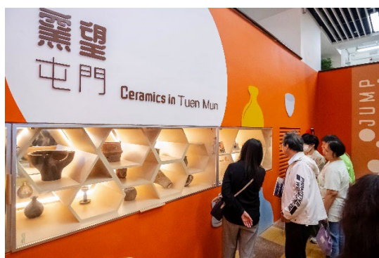
Ceramic artworks and historic Tuen Mun pottery displays help enrich the community's cultural identity.

A guided tour was arranged to visit the key features of the latest Well-Being Design and the artistic displays, including the estate's ceramic art display area. Participants can learn more about the local history through the ceramic works of various artists and traditional pottery from the historic Tuen Mun Dragon Kiln. They also visited the universal service bay and the mobile services vehicle to experience health check-up services and attend health talks.