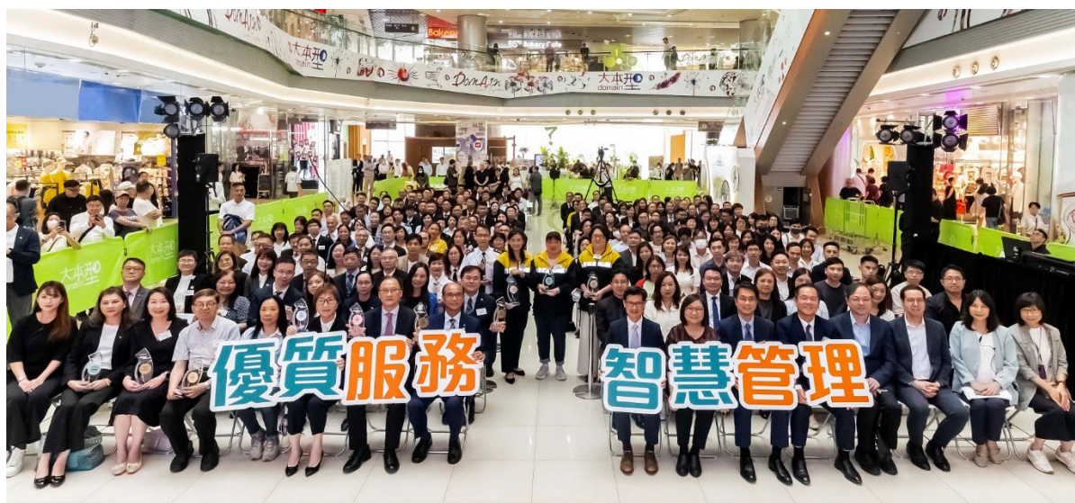
Award winners and guests at the presentation ceremony.