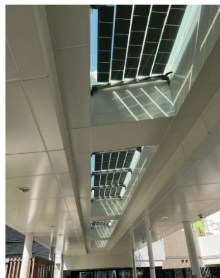
Covered pedestrian walkway using BIPV technology.

In addition, we are committed to collaborating with public institutions and the industry to promote sustainable building development. As an institutional member of the Hong Kong Green Building Council, the HA actively participates in the Council's various committees, keeping abreast of industry trends, applying innovative technologies and products in HA projects, as well as offering constructive ideas and suggestions to green building development. We also regularly attend seminars, workshops, and conferences related to sustainable building to gain the latest insights from the industry, and work closely with building services and structural engineering teams to drive the development of green building standards. We will further strengthen exchanges and collaboration with local and the Mainland stakeholders for creating a sustainable future.