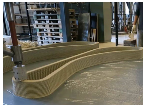
Concrete 3D printed products.