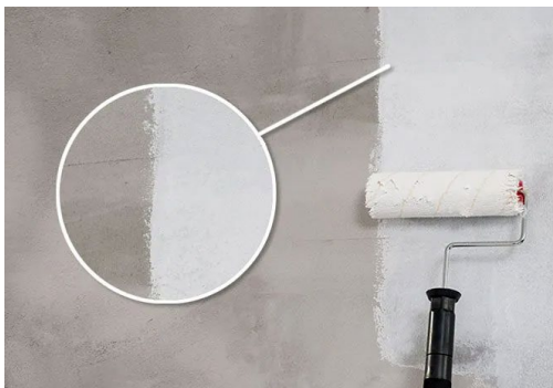
CO 2 absorption paint.