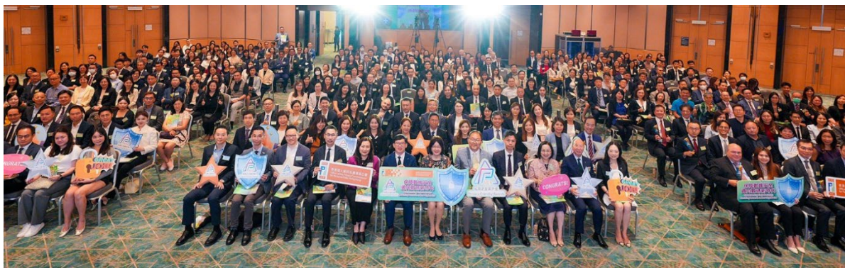
Representatives of award-winning organisations pictured at the awards presentation ceremony.

The Awards were organised by the Office of the Privacy Commissioner for Personal Data, Hong Kong (PCPD). Under the theme of “Safeguarding Data Security: Marching towards a New Digital Era”, the Awards aim to recognise the commitment and performance of enterprises, public and private organisations, as well as government departments in protecting personal data privacy. The HD is one of the 157 award-winning organisations. Information on the Awards is available from PCPD's website .