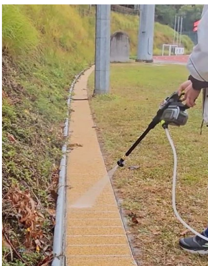
Permeable drainage covers.