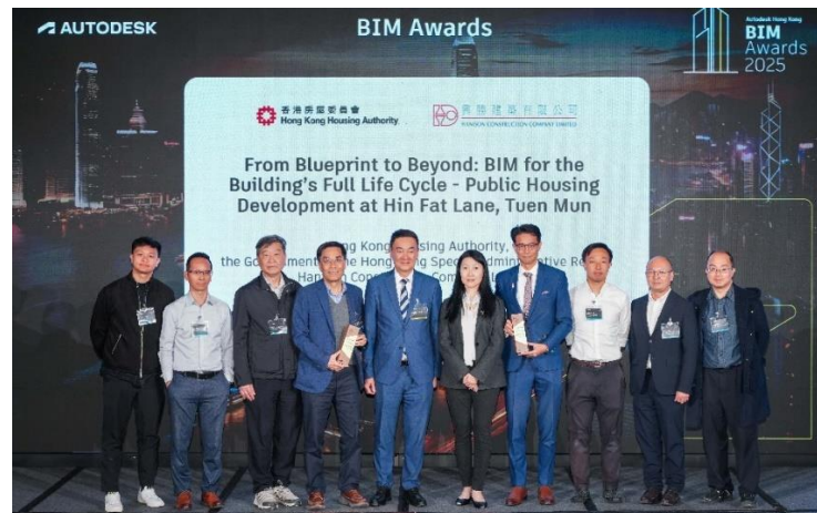
The award-winning team pictured with the main contractor and officiating guests.

The Public Housing Development at Hin Fat Lane, Tuen Mun, has been awarded at the Autodesk Hong Kong BIM Awards 2025 in recognition of HA's application of Building Information Modelling (BIM) technology in this project.