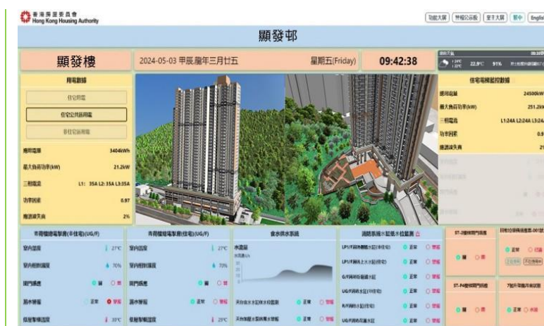
Application of BIM technology.

The project is one of the first projects to integrate BIM technology with Geographic Information Systems to establish a unified data platform. Internet of Things sensors have been adopted to monitor photovoltaic panels, electric vehicle charging facilities, and water systems, achieving low-carbon operation and sustainable development.