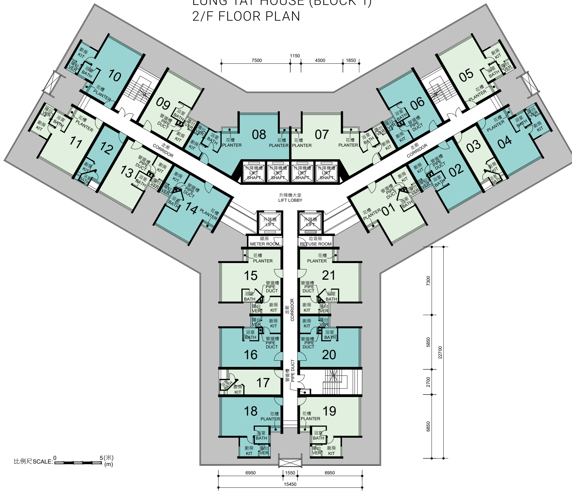
LUNG TAT HOUSE (BLOCK 1) 2/F FLOOR PLAN