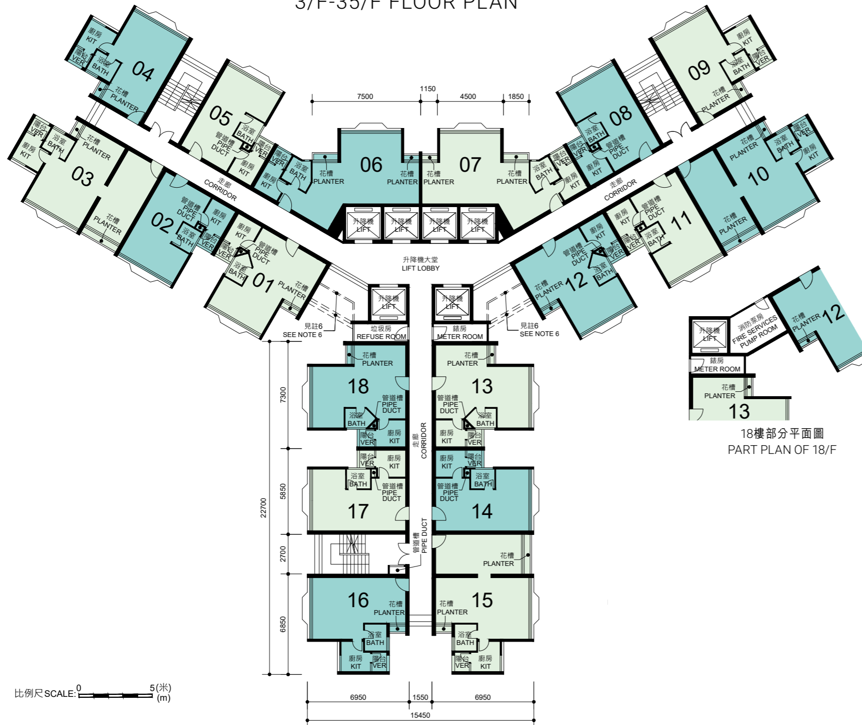
龍裕樓 (第3座) 3樓至35樓平面圖 LUNG YUE HOUSE (BLOCK 3) 3/F-35/F FLOOR PLAN

The floor plan is extracted from the sales pamphlet of Lower Wong Tai Sin (1) Estate printed in September 2021 for the sale of Recovered Flats from Estates under Tenants Purchase Scheme and is for reference only. The plan of individual floor (if the floor plan covers more than one floor) or flat may vary from the above floor plan. Prior to purchasing a flat in the HOS Secondary Market, prospective purchaser should carry out on-the-spot visit to get to know the existing condition of the flat.