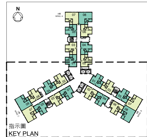
指示圖 KEY PLAN 比例尺 SCALE: 0 5 (米) (m)