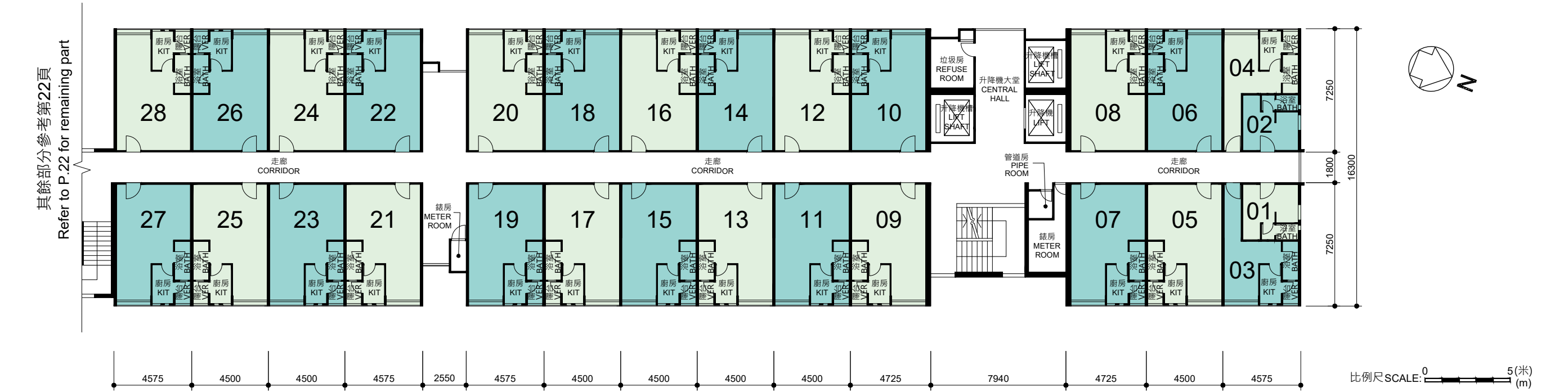
屋邨的住宅物業的樓面平面圖 Floor Plans of Residential Properties in the Estate

樓宇平面圖摘錄自為出售租者置其屋計劃屋邨回收單位而於2021年9月印製的德田邨售樓小冊子，只供參考。個別樓層（如平面圖覆蓋多於一樓層）或單位的圖則跟上述平面圖或有差異，擬於居屋第二市場購買單位人士在購買單位前，應實地參觀並了解擬選購單位的現狀。 The floor plan is extracted from the sales pamphlet of Tak Tin Estate printed in September 2021 for the sale of Recovered Flats from Estates under Tenants Purchase Scheme and is for reference only. The plan of individual floor (if the floor plan covers more than one floor) or flat may vary from the above floor plan. Prior to purchasing a flat in the HOS Secondary Market, prospective purchaser should carry out on-the-spot visit to get to know the existing condition of the flat.