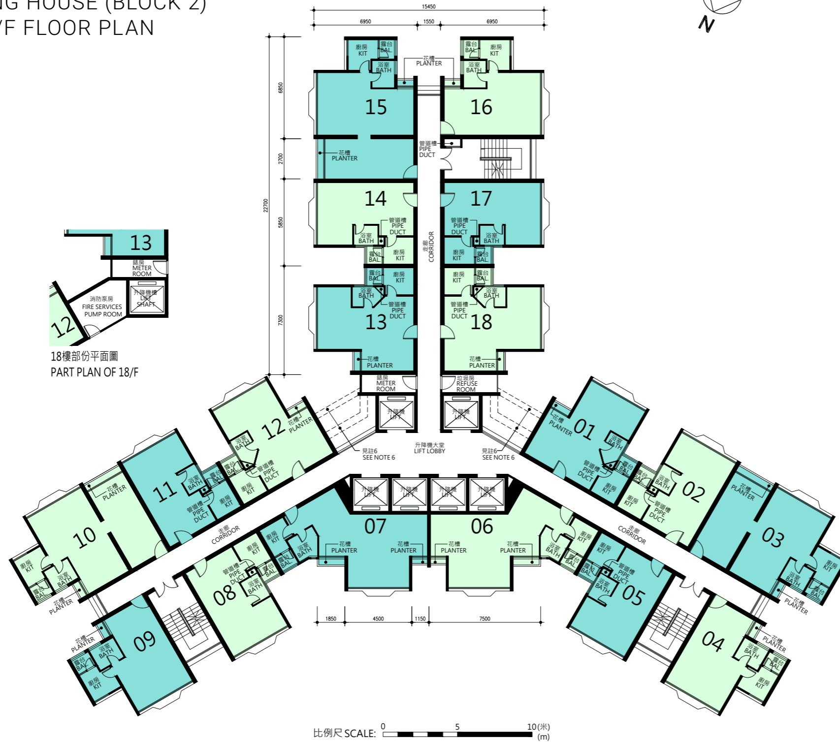
18樓部份平面圖 PART PLAN OF 18/F