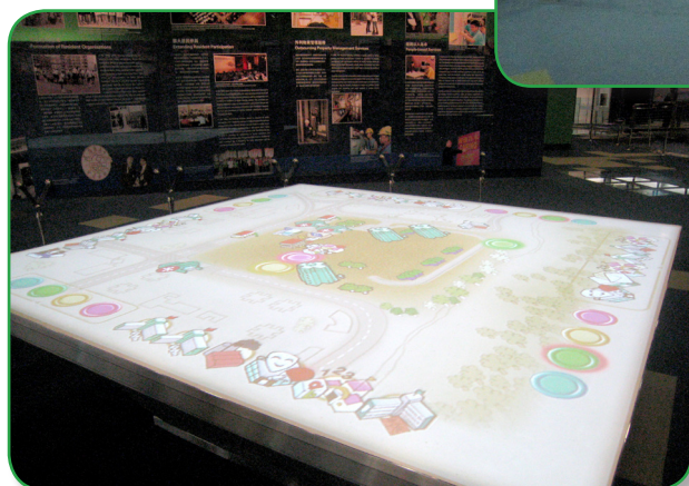
Interactive visual equipment in Exhibition Centre