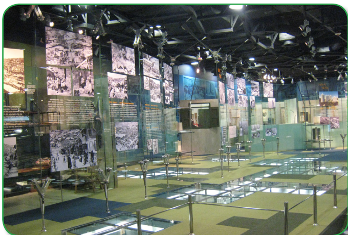
Display panels in the Exhibition Centre

The Exhibition Centre, located at HA’s Headquarters, is a showcase of public housing development in Hong Kong. The Centre enables visitors to learn about the past, present and future of our living environment and know more about public housing development in Hong Kong. Since its opening in 2002, over 160 000 people have visited the Centre and over 10% of them are government officials from the Mainland and overseas. The Exhibition Centre was refurbished in 2009 to provide an innovative, entertaining and interactive venue with adoption of more audio-visual equipment for visitors.