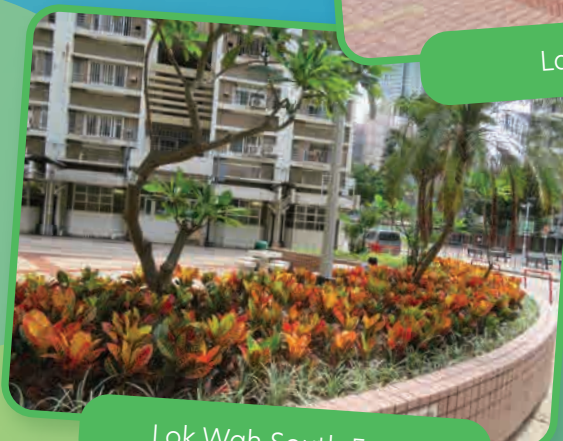
Lok Wah South Estate