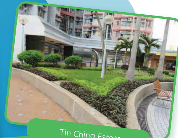
Tin Ching Estate