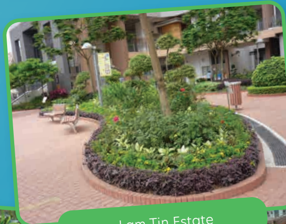
Lam Tin Estate