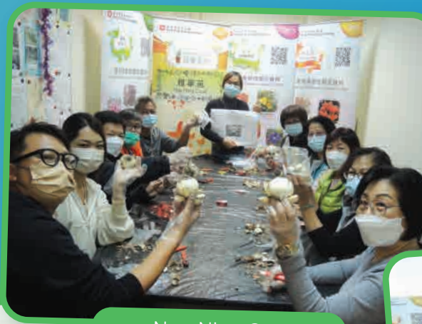
Nga Ning Court