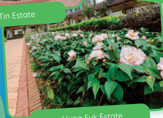
Hung Fuk Estate