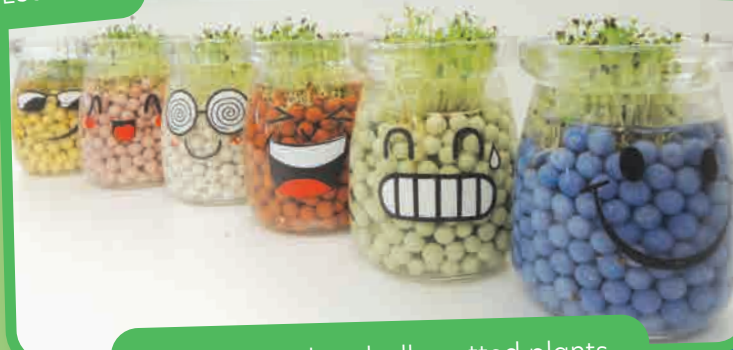
Ceramic carbon balls potted plants