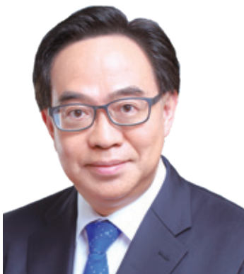
盧偉國議員, SBS, MH, JP Dr the Honourable LO Wai-kwok, SBS, MH, JP

盧偉國博士是立法會議員，他本身是機械工程師，擁有工業工程碩士及工學博士學位。盧博士除擔任香港房屋委員會委員外，也是醫院管理局大會、西九文化區管理局董事局及機場管理局董事會的成員。