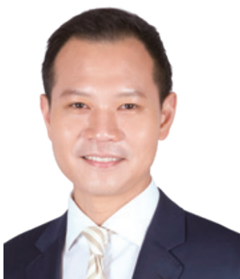
郭榮鏗議員 The Honourable Dennis KWOK Wing-hang

郭榮鏗先生是代表法律界的立法會議員，於2012年當選，並於2016年連任。現為公民黨執行委員會成員（黨務發展）及專業議政召集人。