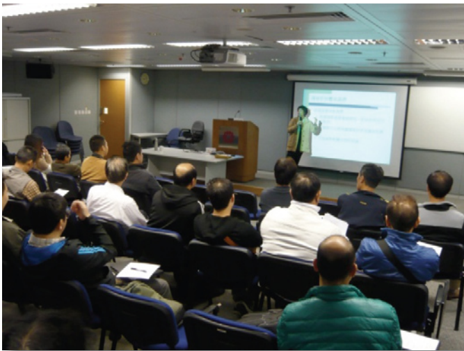
Awareness Briefing Class

To facilitate implementation, and also as a training requirement of the ISO 14001 standard, briefings and workshops were provided to property management staff as well as the cleansing and security services contractors before the implementation of the EMS. With the aid of audio-visual equipment, frontline staff could access to the training materials, operation guidelines, and other relevant documents at the ISO 14001 web-pages.