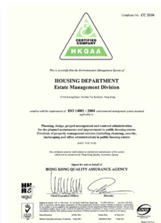
ISO 14001 Certificate for EMD