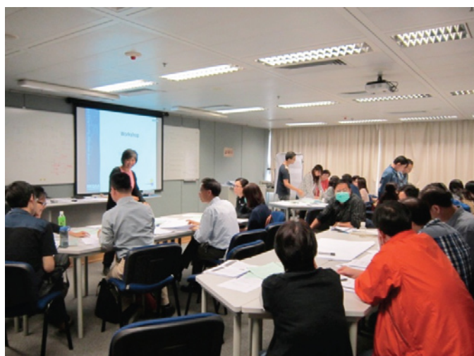
Training Workshop for Internal Auditors