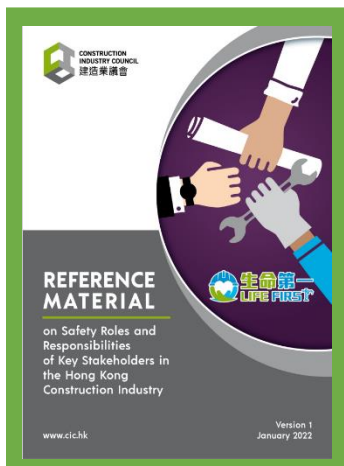
Reference Material on Safety Roles and Responsibilities of Key Stakeholders in the Hong Kong Construction Industry