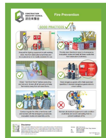
Poster – Fire Prevention