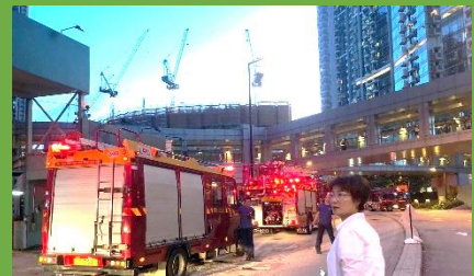
Please click the above image to watch a video regarding a fire incident occurred at a construction site in Tseung Kwan O on 3 July 2024.