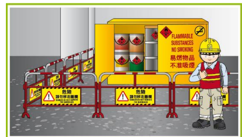
Maintain good housekeeping and store flammable materials properly