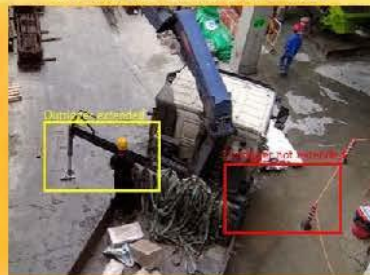
Outrigger Extension Alert