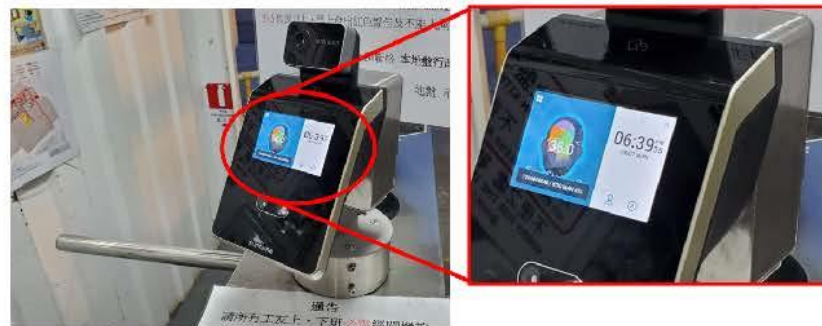
人像識別及體溫監控入閘機 - 讀取體溫