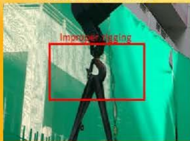
Rigging Method Alert