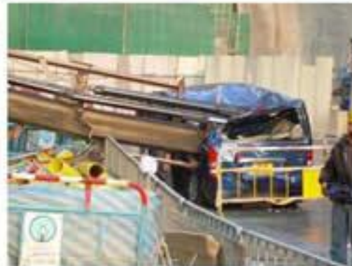
8 Case 1