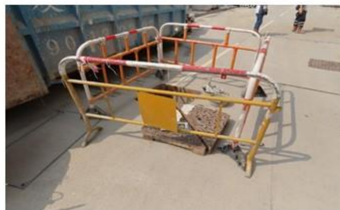
Sun Fook Kong

Ma On Shan Road and Hang Tai Road, Ma On Shan Area 86B Phase 1