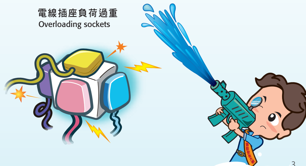
電線插座負荷過重 Overloading sockets