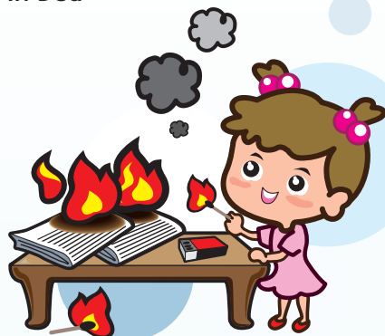
讓小孩玩火 Letting children play with fire