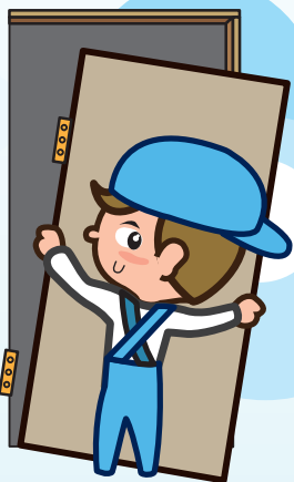
拆除廚房防煙門 Removing the fire-resistant kitchen door