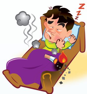
在床上吸煙 Smoking in bed