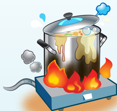
置爐火不顧 Leaving cooking unattended